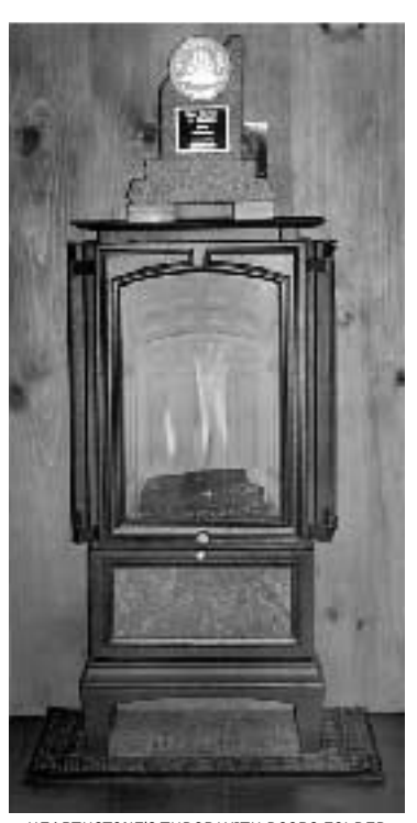
HEARTHSTONE'S TUDOR WITH DOORS FOLDED BACK AGAINST THE SIDES. ON TOP SITS THE VESTA AWARD.

Up until now the Morgan fireplace insert was the only non-catalytic cast iron wood-burning insert on the market. Now there is another larger ver-