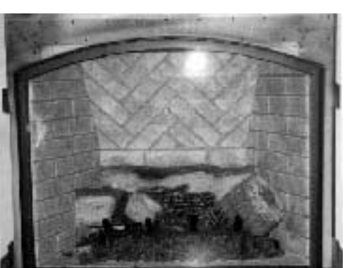
NEW TOWN AND COUNTRY 36 ARCH

shorter box – same size firebox and same big flame, but a 16 inch shorter unit and lower mantle clearances. The TC42 was also shown with porcelain black panels, which