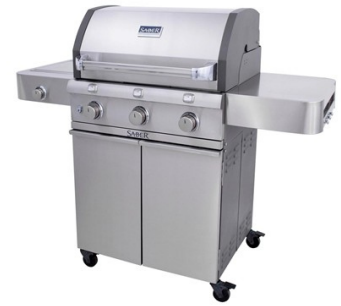
Saber 500 Cast

Also the Saber® SS 500 R50SB0412 Retail $1749 full sized built-in 3 burner grill loaded with features such as electronic ignition, halogen lights and a 18,000 BTU side burner.