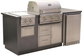
Saber Outdoor Kitchen—in silver Available in fridge or ice chest models