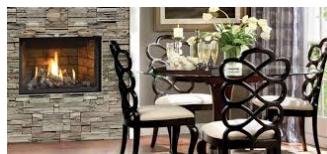
Skyline ZCV3622 starting at $1444

Add some sizzle with the incredibly versatile Solara which looks at home with a classic mantle or contemporary wall surround. Standard features include millivolt or IPI valve system. Optional features include designer clean view circulating kit no louvers required!