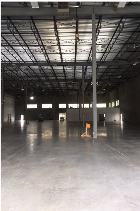
We will have 30,000 square feet of storage (shown with the new office in the background)

The new building (and it is indeed brand new—the pictures here were taken May 25th) is going to be a much better fit for Northwest Stoves for years to come. With 30,000 square feet of warehouse space—more than double our current level – we will continue to stock the products our dealers require all under one roof.