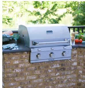
Saber 500 Built-in

Some notable features and benefits of the Saber® line includes a cooking grate and IR emitter system making maintenance and clean up a breeze. All Saber® grills burners, IR emitters and cooking grates are built with 304 commercial grade corrosion resistant stainless steel, guaranteeing years of worry free, maintenance free cooking enjoyment.