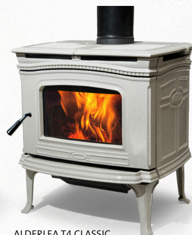
ALDERLEA T4 CLASSIC