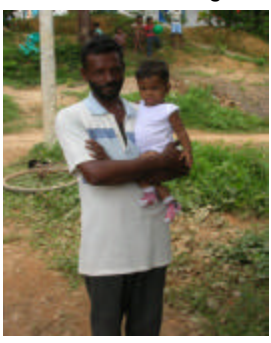
Happy new home owner with his daughter