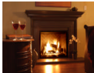
Town & Country's new TC30 with Country Home Logset and Heritage Red Brick Panels

remote system for a fireplace of this type anywhere and you can see why all the rest are doing their very best to keep up. Town & Country is truly an industry leader.