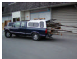
Ron picks up a wee bit of firewood