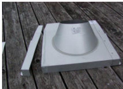
Ron adjusts the metal roof flashing to work with a square support

If you come across something in the field that you need to "tweak" to make it work, we'd like to hear about it. Send in your installation stories (with pictures if possible) to nws@northweststoves.ca .