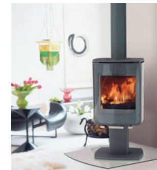
The Jotul F370—a 'swivelling' stove, which turned heads

Some of the new items we may be seeing soon included: