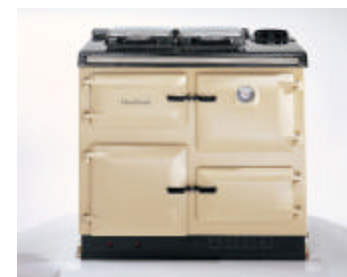
Heartland's Cookmaster in Cream

The Heartland Cookmaster is a unique cooking range which features a powerful thermostatically controlled 50,000 BTU burner which is designed to heat up quickly. Offered in a 36" wide model, it fits nicely between standard kitchen cabinets. The Heartland Artisan is a woodburning