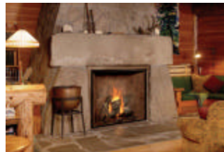
Soon to be available, the TC54 will take your breath away