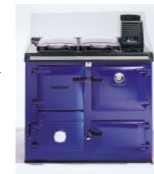
Heartland's Artisan in Blue

feature to any range. When in the closed position they retain the hotplate heat leaving the highly polished finish warm to the touch. When open, heat radiates into the room.