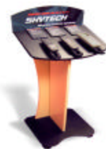
Skytech's new floor display

be used. To get your display, simply order three remotes from which you will receive a 20% discount. On your P.O., be