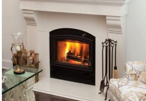
Opel 3 Catalytic

Please contact your sales rep for further information.