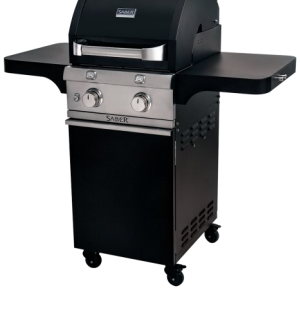
Cast 330 P

existing Saber products, including stainless steel cooking grates,