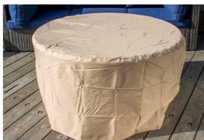
Includes a Water-Resistant Cover