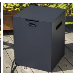
FP-420-BK Optional - Tank Holder