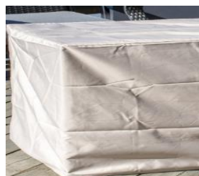
Includes a black Water-Resistant Cover