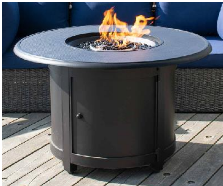
FP-541 BK Round Stamped Wood Grain Fire Table