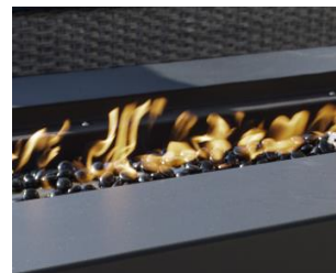
Includes Black Fire beads