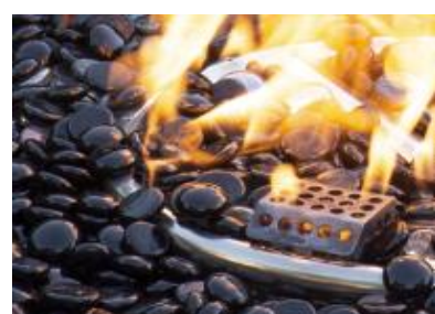
Includes Black Fire beads