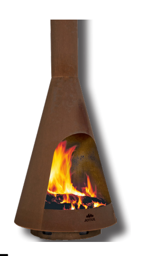
Frøya (Weight: 45 lbs) 57 1/2"H x 23"D x 23"W