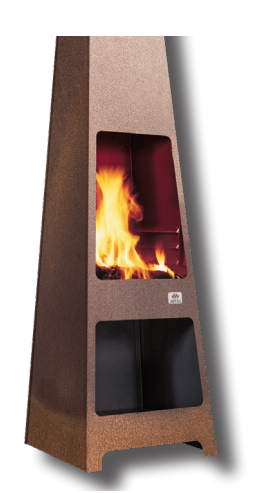
Loke (Weight: 92 lbs) 58 1/4"H x 15 3/4"D x 15 3/4"